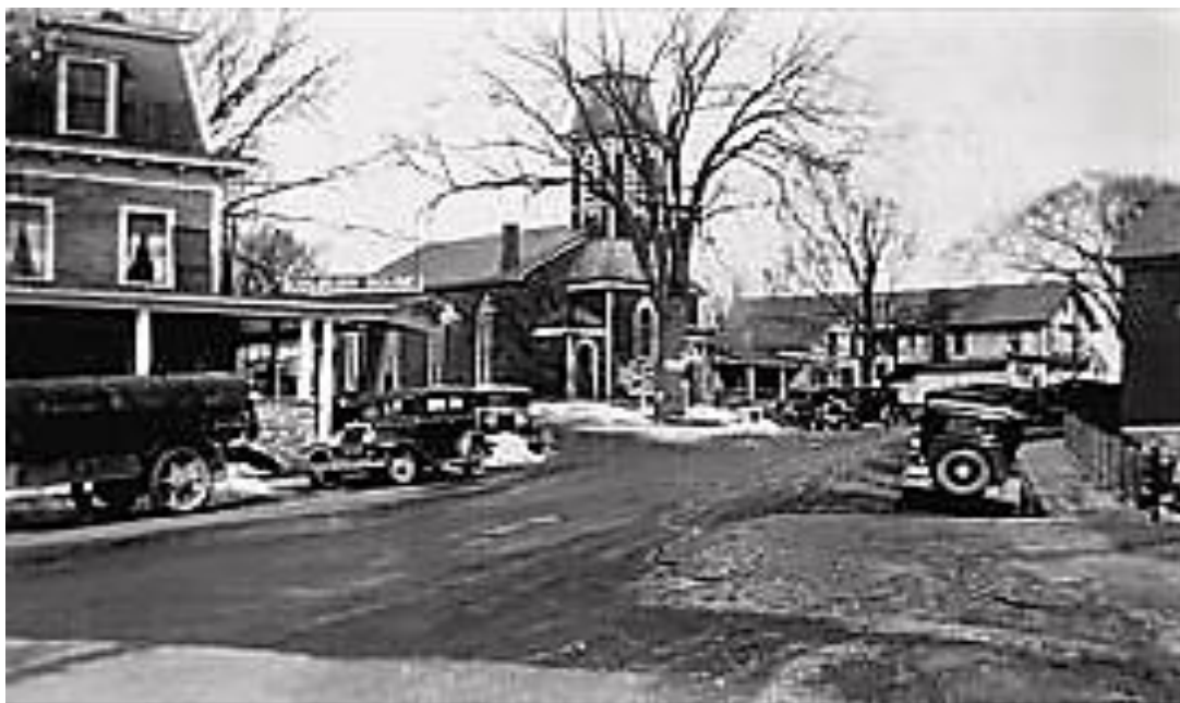
A photo from the Manchester Historical Society - probably from the early 1930's.